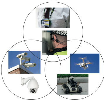
Figure 4: Camera network platforms vary, leading to platform heterogeneity. BWV/IBV has received little attention so far from the research community.