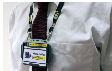
Figure 2: Edesix's VideoBadge.

While CCTV is usually used to observe a specific area, BWV and IBV are employed by individual users. Users are categorised into two groups either where mobile cameras are carried as part of their job (BWV) or for their own safety and when video should be recorded for legal purposes (IBV). BWV is worn by personnel that often and repeatedly come into situations where video evidence has to be taken (e.g., a police officer, or a bailiff). IBV, on the other hand, is only turned on in rare situations (e.g., a shopkeeper at the airport is faced with an incident). In both cases, however, the worn cameras is used to capture evidence of a situation. Current surveillance networks, deployed in the field, combine standard equipment, mounted at fixed locations, with novel, mobile BWV/IBV (cp. Figure 1).