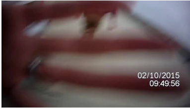
Figure 3: Footage occluded by a hand. It is unclear if this is the hand of the wearer or another person. Further, from the video footage alone, one cannot determine if this is intentional or accidental.

On the other hand, mobile cameras will be integrated into fixed surveillance networks at runtime, which might not occur voluntarily. This gives rise to a potential security issue. Using only fixed cameras allows exploitation of the network topology in performing person re-identification [32, 33]. BWV/IBV introduces a permanently changing topology, requiring the constant updating of topology information within the network. Integration itself does not guarantee compliance of the wearer. This means, coordination of mobile cameras might only be possible to a certain degree or not at all. One might think of situations where it is simply too dangerous and the wearer of a mobile camera decides not to relocate there. Being a mobile camera and being able to relocate also introduces ongoing change to the network. This can be introduced because the wearer wants to leave a specific area or because the video footage is obscured on purpose. Such a situation is shown in Figure 3. It is unclear if the wearer is occluding the FOV of the camera or if another person is obscuring the FOV. Furthermore, it is not clear if this is done on purpose or accidentally.